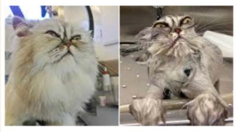
It was yogalates.