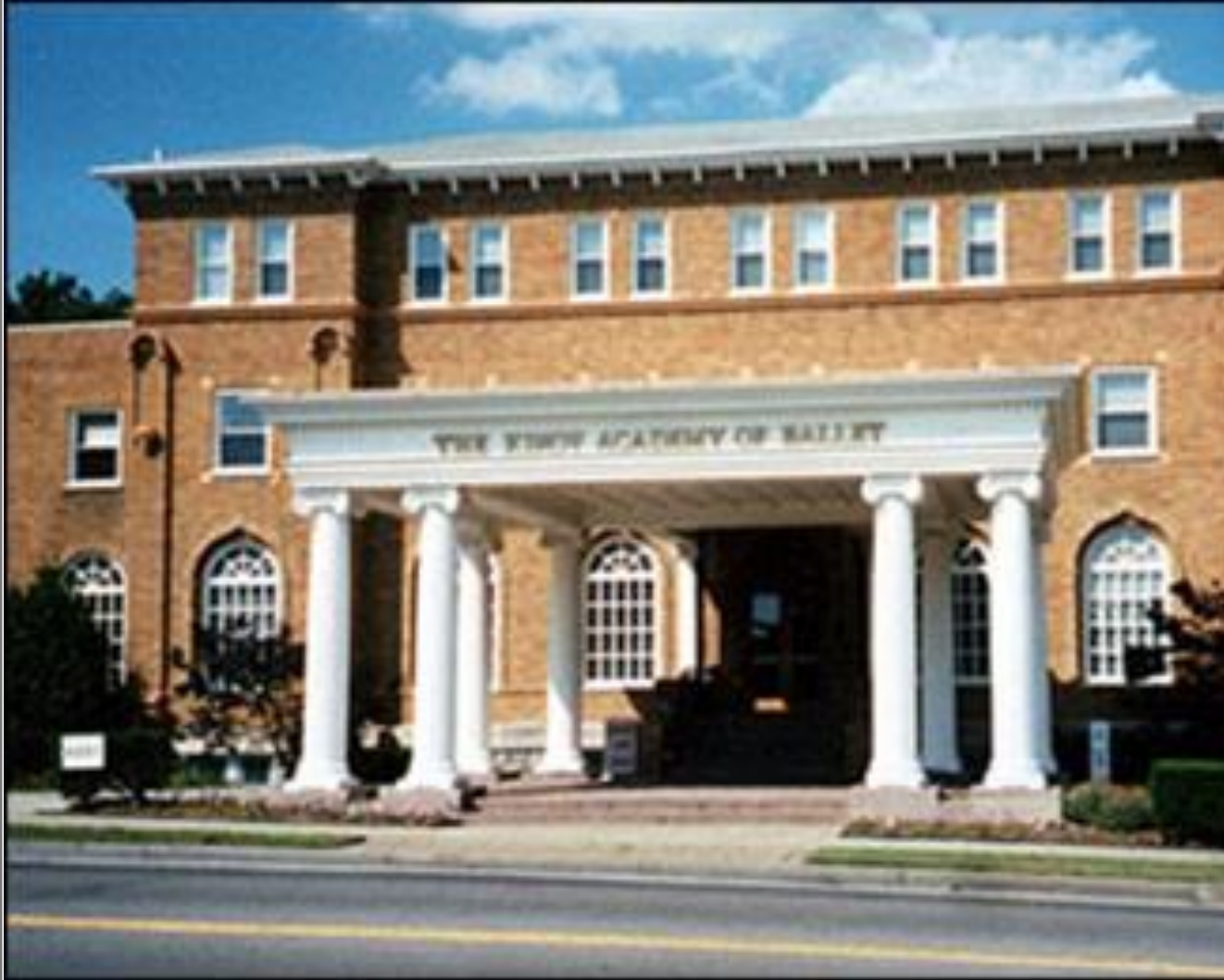
Front Door (on Fort Drive)