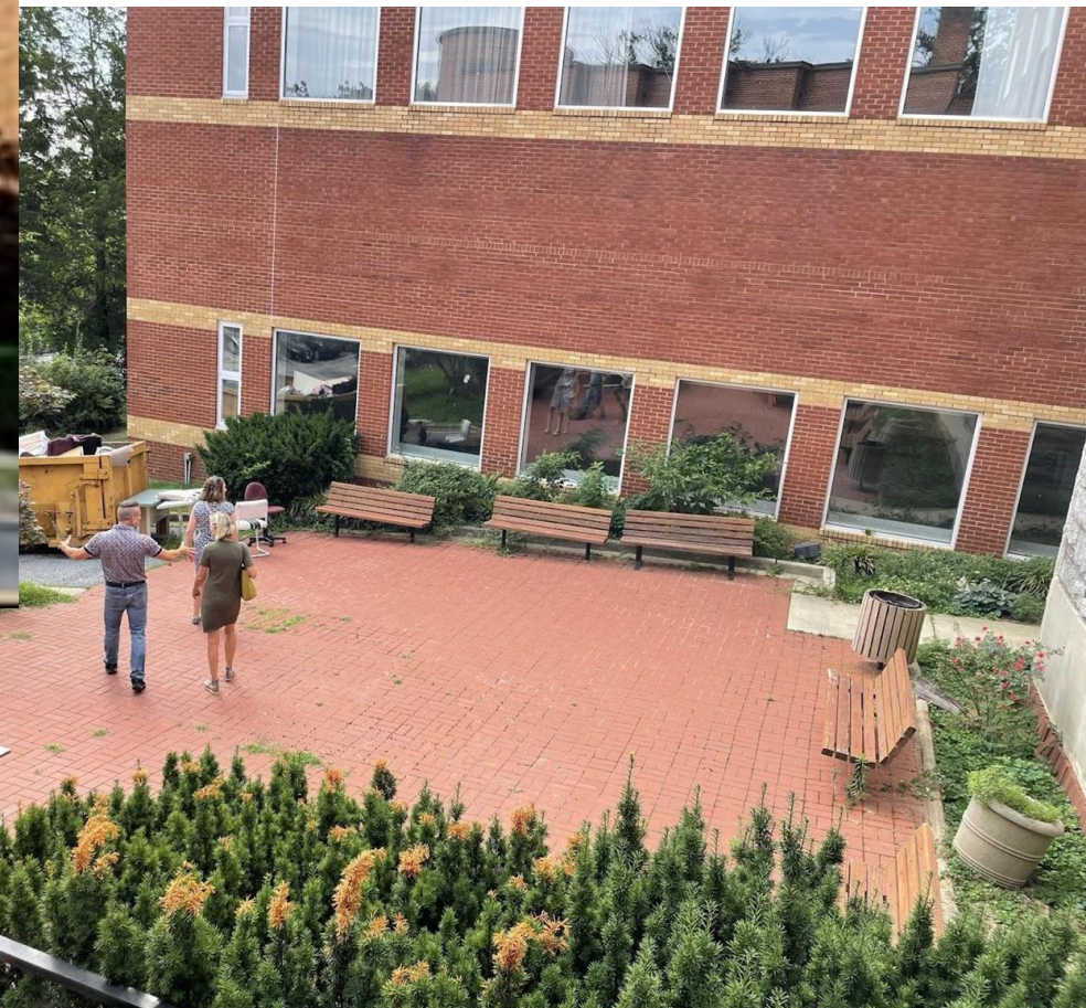
Back terrace near parking lot